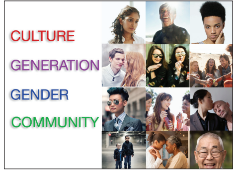
Figure 3. New Approach