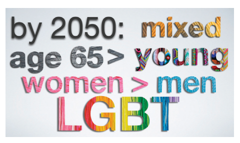
Figure 1. Key Statistics

The consumer population of the future will have a majority of "others," self-identified groups that may look and act nothing like today's consumers. Brands must take serious consideration of a more holistic consumer view. Detailed in this paper are four spectrums, which describe and illustrate with case studies, brands that are moving in the correct direction,