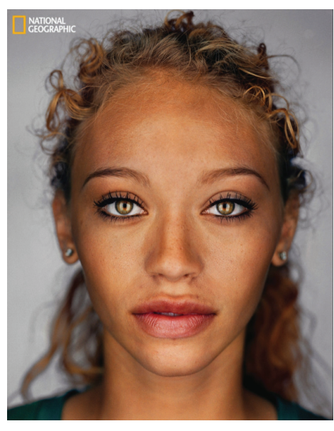
Figure 4. National Geographic: Changing Face of America

that is, alongside the consumer. This new approach is not about creating four new boxes in which to segment consumers. It is about engaging consumers across the more holistic identity drivers of culture, gender, generation, and community.