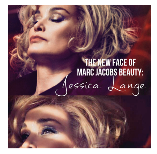
Figure 5. Marc Jacobs Beauty

Age does not define product need, even in beauty. Generational values are a much stronger indicator of a consumer's purchase intent.