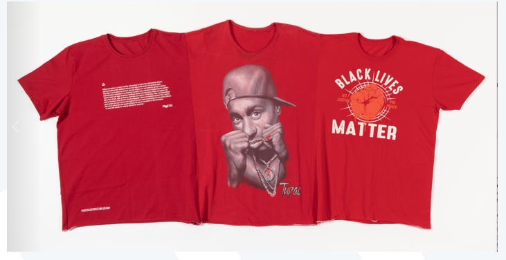
Beau McCall Black Lives Matter triple T-shirt, 2021.

Born in the Bronx in 1973, hip hop was the invention of Black and Brown youth who created an innovative style of music, dance, and visual art that spoke to their lifestyles. Within two decades, hip hop had spread beyond the borders of New York City to impact international culture. Fashion and style were, and are, a major part of hip hop's appeal. Yet hip hop style is more multidimensional than many realize. Artists and fans have used fashion to embrace historic glamour, convey messages of Black pride and activism, and express their individuality and unapologetic style. These fashions include the Adidas sneakers, tracksuits, and shearling coats popularized by Run DMC; the Karl Kani clothing worn by Tupac Shakur; and Aaliyah's iconic Tommy Hilfiger bandeau and jeans ensemble, as well as other designer looks worn by Lil' Kim, Cardi B, and Lil Nas X.